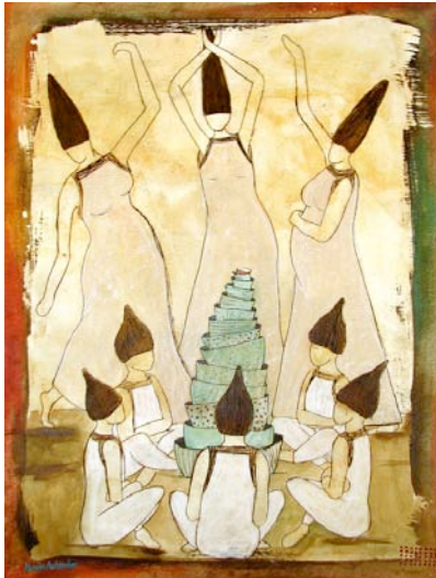
Original Artwork for Silent Auction at Stone Soup Jan 29

250 Madison Avenue Toronto, ON Canada M4V 2W6 | www.waldorfacademy.org | e. info@waldorfacademy.org | p. 416.962.6447 | f. 416.975.5513